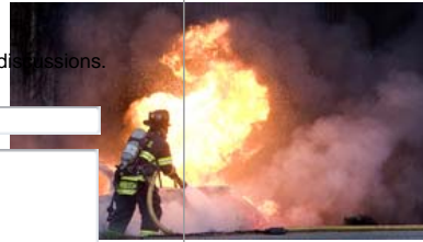
A firefighter puts out a pick-up truck that ended up in the ditch with a white Chevy sedan about a mile east of the exit on Interstate 64 Thursday evening. More »

Upload Your Photos | Buy Photos More photo galleries