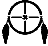
(53) FOUR DIRECTIONS