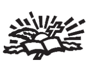
(67) POLISH NATIONAL CATHOLIC CHURCH