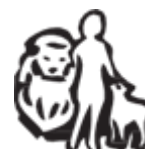
(20) COMMUNITY OF CHRIST