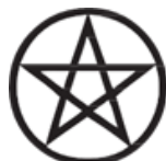
(37) WICCA (PENTACLE)