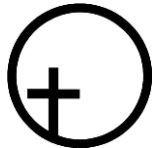
(73) UNIVERSALIST CROSS