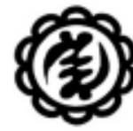
(63) AFRICAN ANCESTRAL TRADITIONALIST