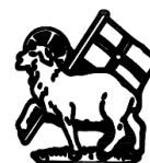
(27) UNITED MORAVIAN CHURCH