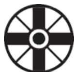
(24) THE CHURCH OF WORLD MESSIANITY