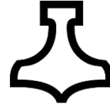
(55) HAMMER OF THOR