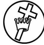
(47) FIRST CHURCH OF CHRIST, SCIENTIST (CROSS & CROWN)