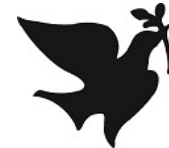
(77) DOVE OF PEACE