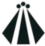
(65) DRUID (AWEN)