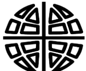
(72) EVANGELICAL LUTHERAN CHURCH