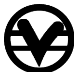
(25) UNITED CHURCH OF RELIGIOUS SCIENCE