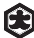
(34) IZUMO TAISHAKYO MISSION OF HAWAII