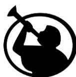
(11) MORMON (ANGEL MORONI)