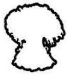
(79) CHURCH OF GOD IN CHRIST