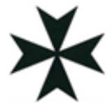
(64) MALTESE CROSS