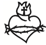
(62) SACRED HEART