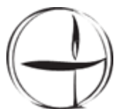
(8) UNITARIAN (FLAMING CHALICE)