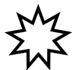
(15) BAHAI (9-POINTED STAR)