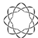
(35) SOKA GAKKAI INTERNATIONAL (USA)