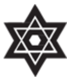
(3) JUDAISM (STAR OF DAVID)