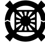
(56) UNIFICATION CHURCH