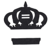
(78) KINGIAN FAITH