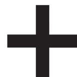
(14) GREEK CROSS