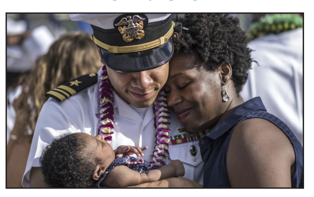
Virginia Veteran and Family Support is here to help. We provide access to support services that are dedicated to helping you and your family move forward with your lives.